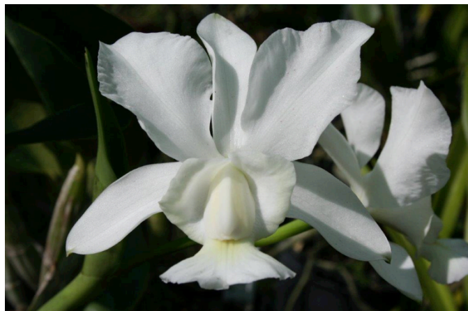
Cattleya walkeriana var. alba "Orchidglade" Gardner 1843

This is the albino version of an orchid which grows in a large region of the Brazilian interior to the south of the Amazon basin. It is found at an altitude of 600 – 900m on rough barked trees near waterfalls or on limestone ridges or mesas, which soak up large quantities of water during the rainy season. This water is slowly released by transpiration from the trees, giving higher humidity to the orchid's micro-climate in an otherwise dry area.